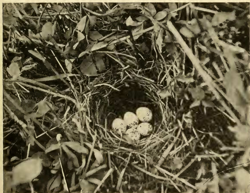
HENSLOW'S SPARROW. TIFFIN, O., JUNE 3, 1904.